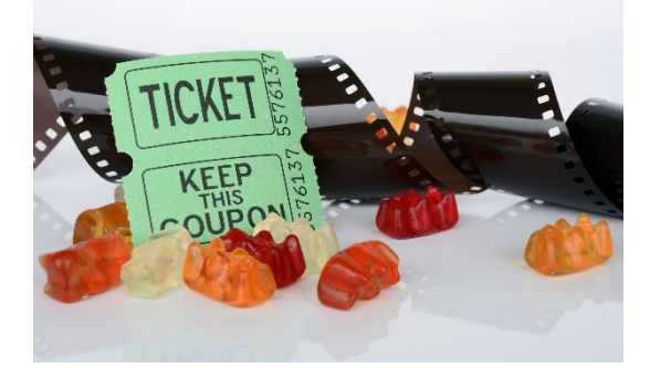
538 movie tickets (retail: $12.99 ticket)

• 2,702 gallons of gas (retail: $2.59 per gallon) CENTERSTONE