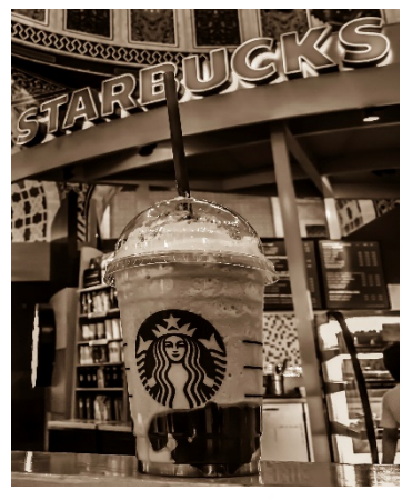
1,573 grande Caramel Frappuccinos (retail: $4.45 per drink)