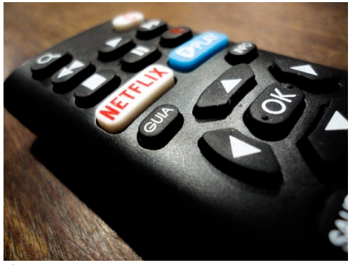
876 months of Netflix (retail: $7.99 per month)