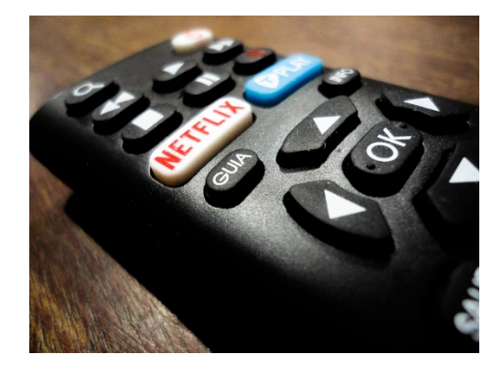
• 9,349 months of Netflix (retail: $7.99 per month)