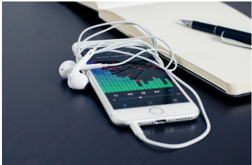
• 5,339 albums from iTunes (retail: $13.99 per album)