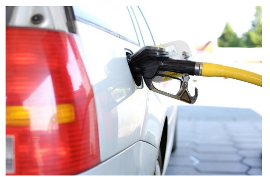
28,841 gallons of gas (retail:$2.59 per gallon)