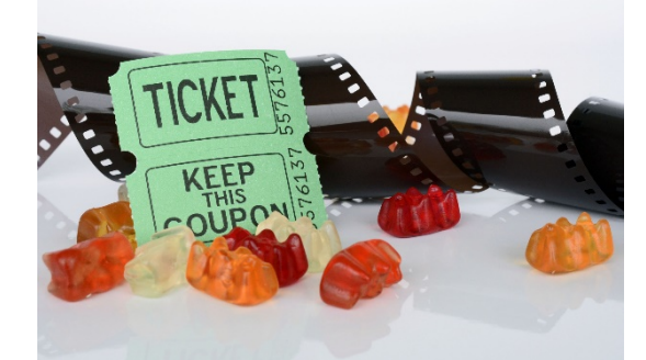
5,750 movie tickets (retail: $12.99 ticket)