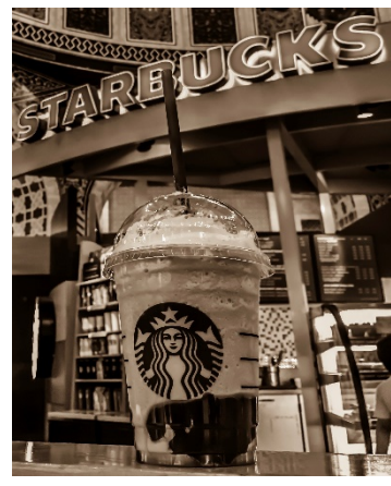
16,786 grande Caramel Frappuccinos (retail: $4.45 per drink)