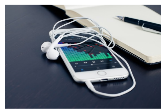
• 500 albums from iTunes (retail: $13.99 per album)