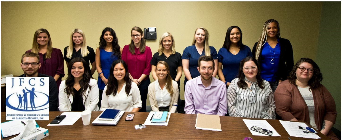
Doctoral psychology interns

Research/Professional Interests: Pediatric neuropsychology, ADHD, health psychology, working with diverse populations