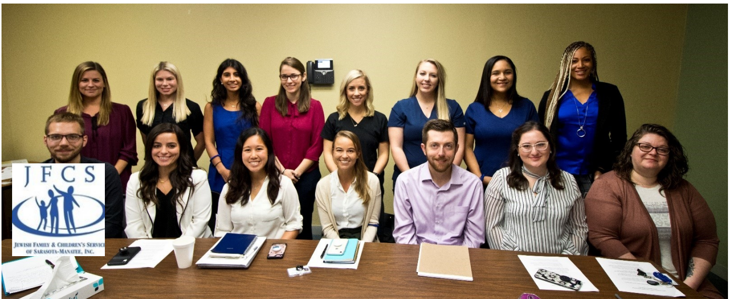
Doctoral psychology interns

Research/Professional Interests: Pediatric neuropsychology, ADHD, health psychology, working with diverse populations